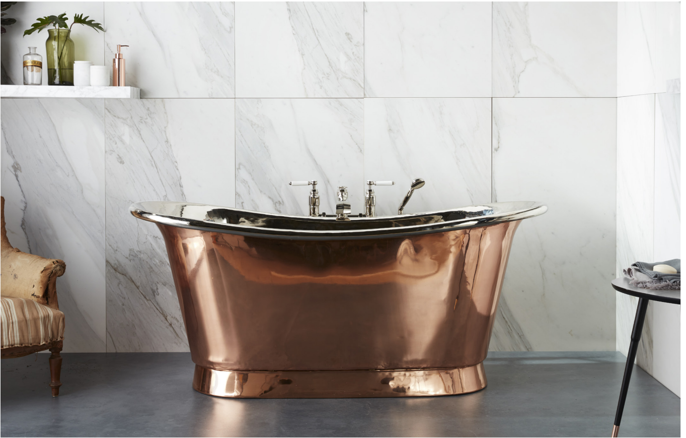
The Tyne Copper ath Tub With Nickel Interior