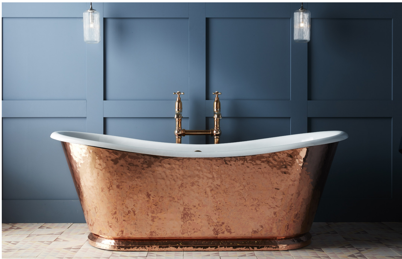
The Wye Large Bateau Cast Iron Bath Tub in a Hammered Copper Finish