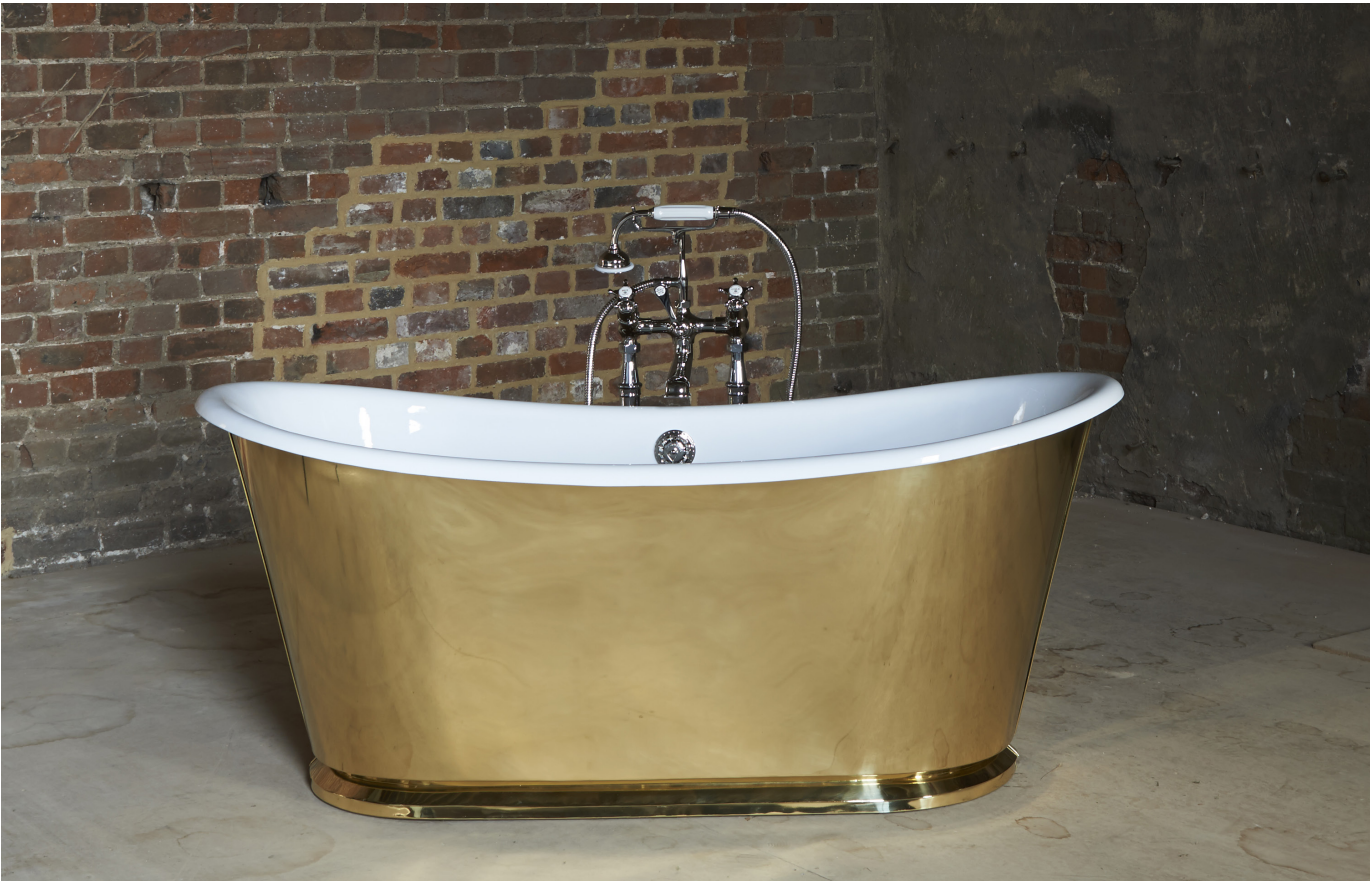
The Usk Bateau Cast Iron Bath Tub in a Brass Finish